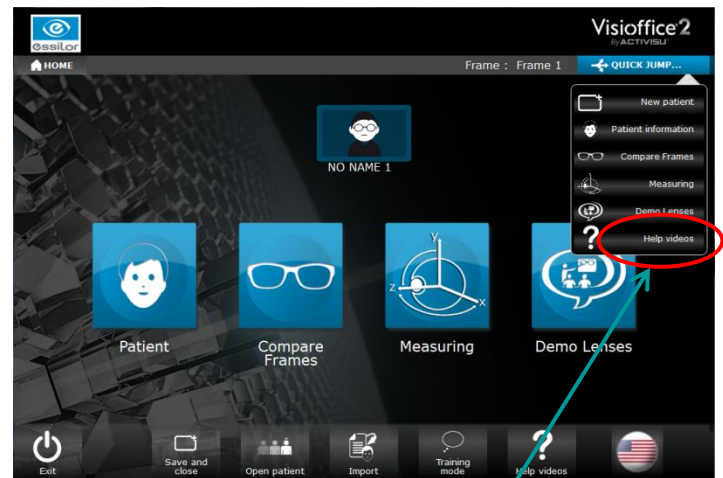
Help videos from Quick Jump